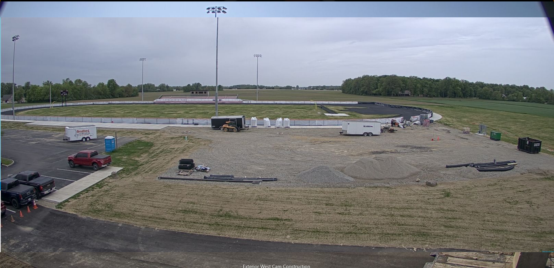
Exterior West Cam Construction